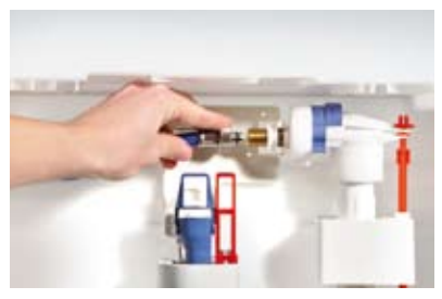
After the shell construction: The reinforced pipe is attached to the push fittings system on the filling valve with no need for tools.

Maintenance is just as easy as assembly. When the valve is replaced, individual parts do not have to be removed or broken off: The valve forms a unit in which all parts are permanently attached to each other.