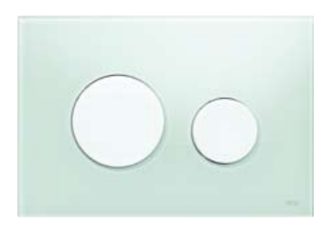
TECEloop glass – one of many TECE push plates for the TECE cistern.

At TECE, all the cisterns and push plates are compatible with each other. However, cisterns from other manufacturers cannot be combined with a TECE push plate.