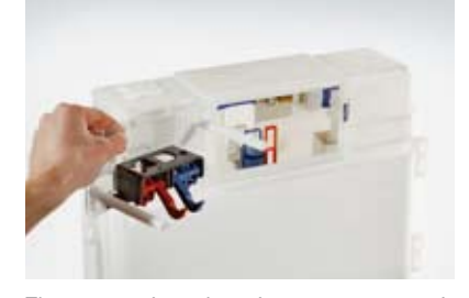
The protective plate is a compact unit consisting of the splash guard, lever mechanism and fixing device.